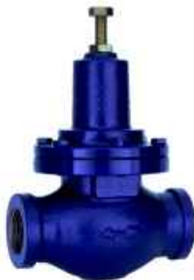
Sustaining Valves – Type A, Type D, Type 9