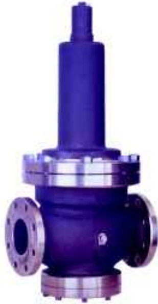
Reducing Valves – A, AB, CL, CN, CH, D, B2