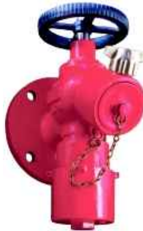
Fire Fighting – Hydrant Reducing Valves