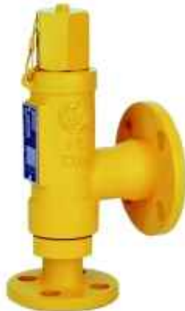
Other Safety Relief Valves – 180 & 180S, 2600