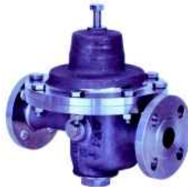
Low Pressure Reducing Valves – CL