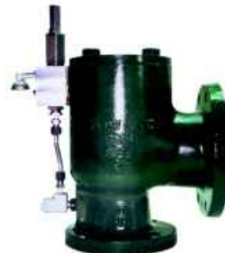
Pilot Operated Safety Valves – Flowsafe

• Speciality casting from in-house foundry in non-ferrous metals • The Series 3500 Safety Relief valve has been combination flow tested with bursting discs from continental (CDC) Disc Corporation • Full repair facilities.