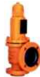
Safety relief valves to API and ASME - Type 3500