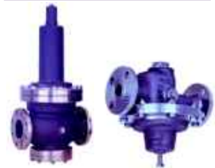
Reducing Valves A, AB, CL, CN, CH, D, B2