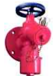
Fire Fighting Hydrant Reducing Valves