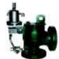
Pilot Operated Safety Valves Flowsafe