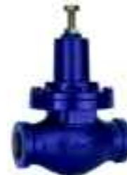
Sustaining Valves Type A, Type D, Type 9